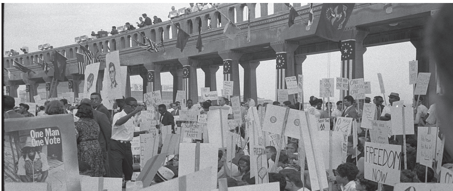
Members of the MFDP protest the 1964 Democratic Convention. Their signs feature portraits of the three Freedom Riders recently murdered in Mississippi.

Despite disagreement over the path to change, these activists understood the desperate need for this act and Johnson’s support.