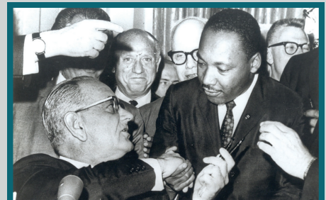
July 2, 1964: Johnson offers Dr. King one of the 70+ pens just used to sign the Civil Rights Act

bipartisanship – cooperation between two political parties