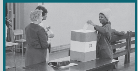
November 4, 1964: An African-American D.C. resident votes at Cardozo High School.