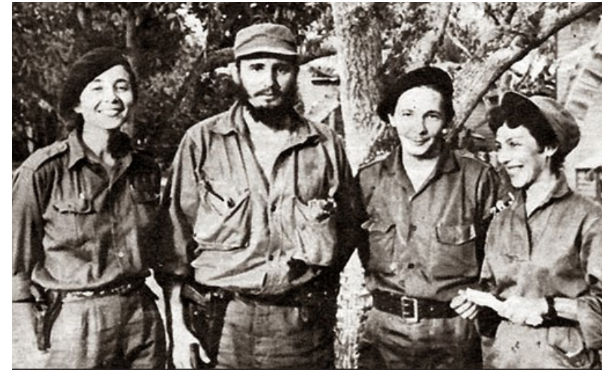
Revolution leaders (from left to right) Vilma Espin, Fidel Castro, Raul Castro and Celia Sánchez in 1957.