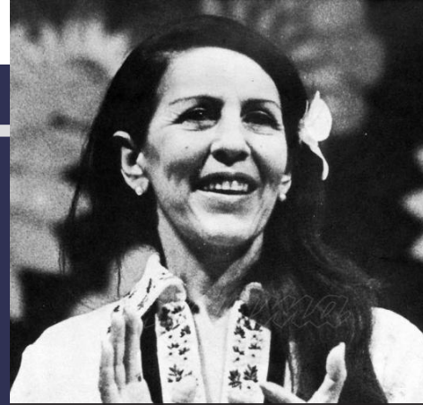
Celia Sánchez with a flower in her hair. Sánchez loved wildflowers and is often associated with orchids and mariposas.

After Castro claimed power, Sánchez became his advisor and contributed to