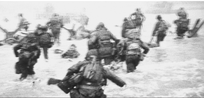
American soldiers storm Omaha Beach on D-Day as photographed by Robert Capa for LIFE Magazine.