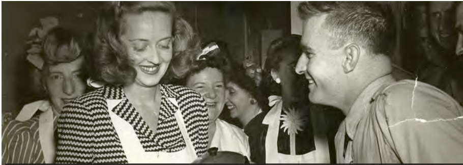
With its success in New York, the American Theatre Wing opened canteens in many other cities, including Boston, Philadelphia and Los Angeles.

The canteen's leaders and volunteers knew how important the canteen was to the health and emotional wellbeing of soldiers on their way into combat. They took their work extremely seriously and committed to working their shifts consistently until the war ended. Cowl told her volunteers, "These men are going to the Philippines. They are going to the Burma Road. Nothing is too good for them."