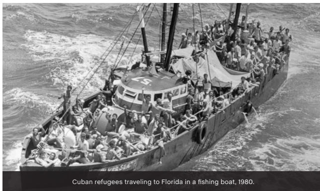
Cuban refugees traveling to Florida in a fishing boat, 1980.

The refugees faced many challenges, including dangerous travel conditions, detainment and deportation, riots, and discrimination. Castro also used this as an opportunity to send inmates from prisons and patients from mental asylums to the U.S.