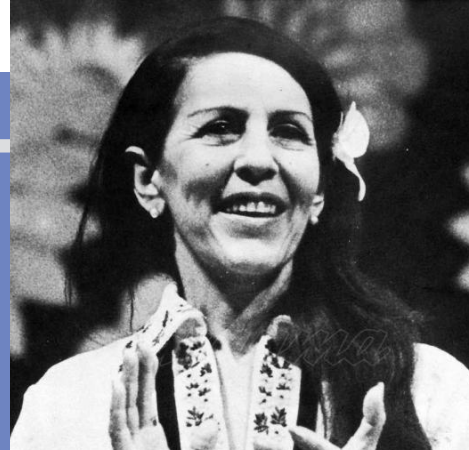
Celia Sánchez with a flower in her hair. Sánchez loved wildflowers and is often associated with orchids and mariposas.

After Castro claimed power, Sánchez became his advisor and contributed to