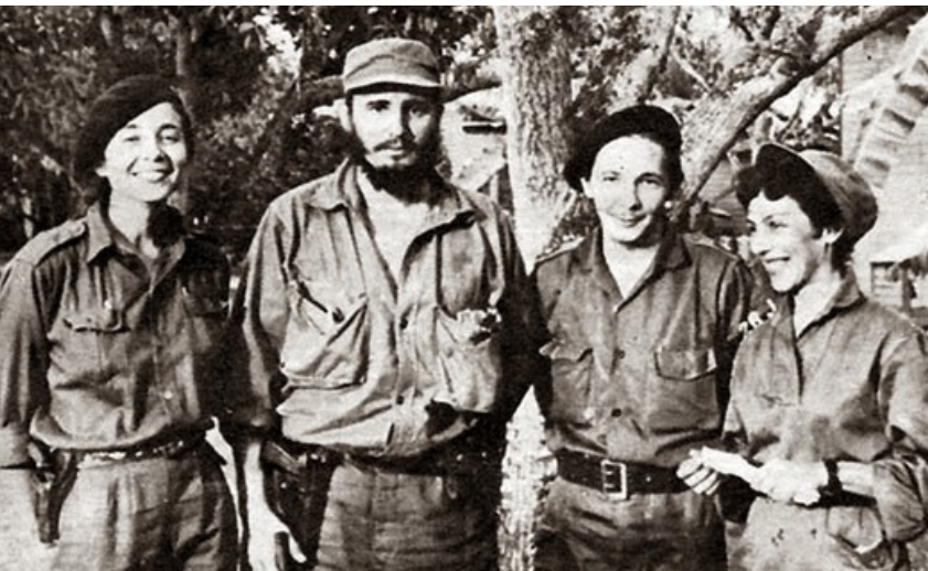
Revolution leaders (from left to right) Vilma Espín, Fidel Castro, Raúl Castro and Celia Sánchez in 1957.