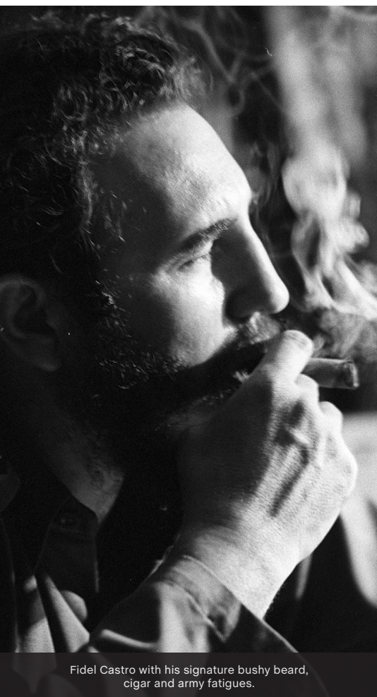
Fidel Castro with his signature bushy beard, cigar and army fatigues.

the new government and culture in many ways. She worked with architects to plan parks and design government buildings and led the movement for a new Cuban aesthetic. She helped develop the Cohiba cigar brand. She started literacy programs and collected documents to create the official archives of the revolution. She did not like to be the center of attention, which allowed her to gather information for Castro. When she died, her funeral was one of the biggest in Cuban history.