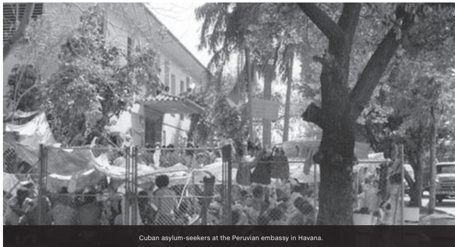
Cuban asylum-seekers at the Peruvian embassy in Havana.

On April 1, 1980, six Cubans crashed a bus through the gates of the Peruvian embassy in Havana and claimed asylum. Five days later, 10,000 people had poured into the embassy, all seeking to leave Cuba with the protection of the Peruvian government. On April 20, Fidel Castro announced that anyone could leave Cuba, but only by boat through the Port of Mariel. Thousands of Cubans flooded to the port and many Cuban exiles in Miami traveled to Cuba to pick up their relatives. Most of them wanted to escape economic hardships, but the U.S. government considered them political refugees and, therefore, allowed more immigrants from Cuba than from other Latin American countries. By May 6, over 15,000 Cubans had arrived in Florida.