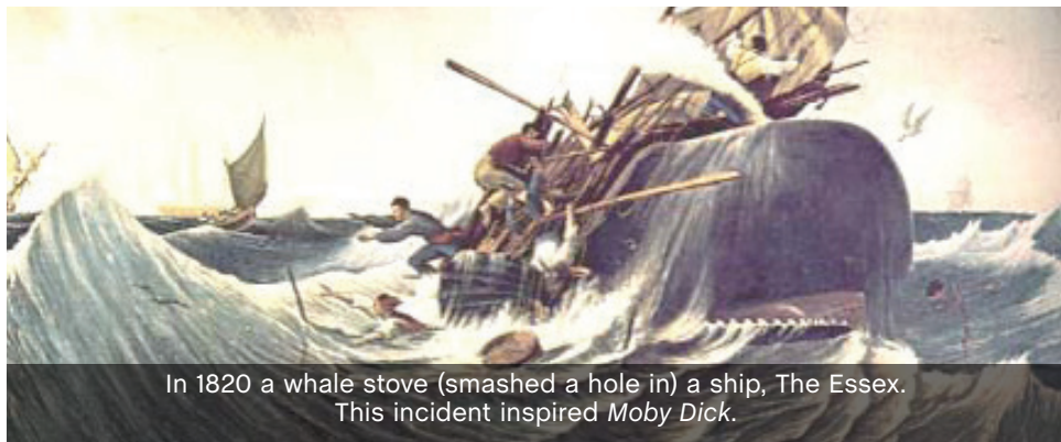
In 1820 a whale stove (smashed a hole in) a ship, The Essex. This incident inspired Moby Dick .

See PBS's detailed timeline of whaling: http://tinyurl.com/pbswhaling .