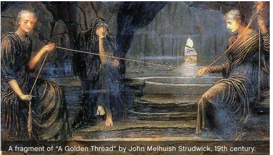
A fragment of "A Golden Thread" by John Melhuish Strudwick, 19th century.

The Fates are three sisters from Greek and Roman mythology, deities who decide the destiny of mortals. One sister weaves the thread of life; the next determines how long each person will live. The final sister uses her scissors to cut that thread, determining when a person dies. They are often pictured as three old crones. They are not characters in the novel Moby Dick , but appear in the play. As you watch the play, consider: what is fate and what is free will?