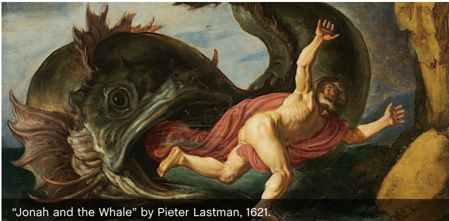
“Jonah and the Whale” by Pieter Lastman, 1621.

Before he leaves Nantucket, Ishmael hears Father Mapple preach about Jonah and the Whale – the other famous whale tale. In this Old Testament story, Jonah tries to flee the Lord on a ship. The Lord sends a storm and, knowing he is responsible, Jonah has his shipmates throw him into the sea. He is swallowed by a giant fish, which is often called a whale. Inside its belly, he worships the Lord, who commands the fish to spit him onto dry land, unharmed. Jonah learns he cannot escape the Lord nor does he wish to.