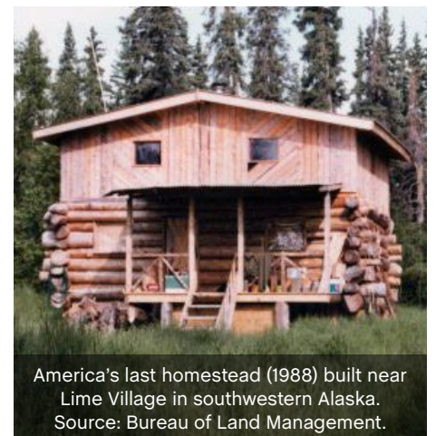
America's last homestead (1988) built near Lime Village in southwestern Alaska.

Though the State of Alaska currently has no homesteading program for its lands, homesteading remains important to many Alaskans today. Many homesteaders or their families still own original claims.