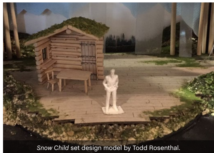
Snow Child set design model by Todd Rosenthal.