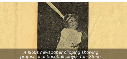
A 1950s newspaper clipping showing professional baseball player Toni Stone.

BATTING AVERAGE A statistic that shows how often a batter gets a hit. A batting average of about .240 is average, .300 is considered excellent and .400 and above is exceptional.